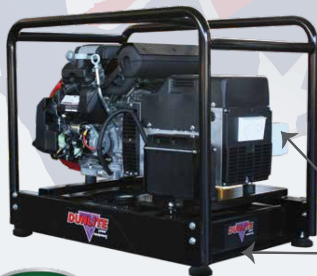
12kVA Honda powered generator Model: DGUH11E-3S-2