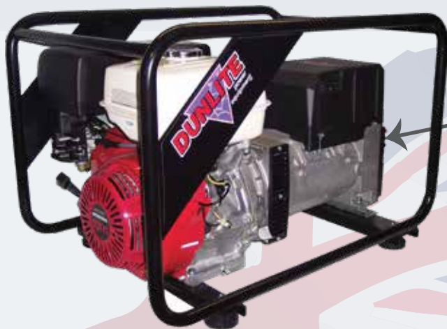
7 kVA Honda powered generator* Model: DGUH6.5-3S-2

These 3 phase petrol generators all come standard with 2 x single phase outlets and 1 x 3 phase 5 pin outlet, Reliable NSM alternator & powerful Honda Australia approved engines.